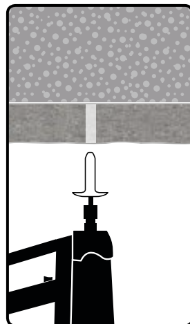
Locate the pre-positioned hole in the insulation sheet Insert fixing into position.